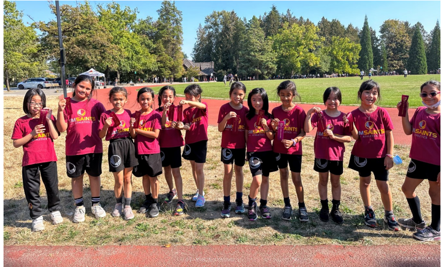
Participating in a Cross Country Meet