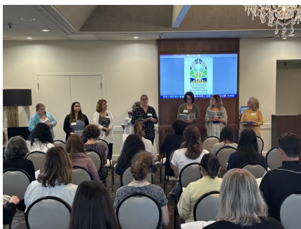
Our staff spent time together at our annual retreat and explored the theme "Living our Faith"

Parents are encouraged to attend the Mass as well, however, you will need to register for free tickets. Please see the Eventbrite link on the parish website to reserve your tickets.