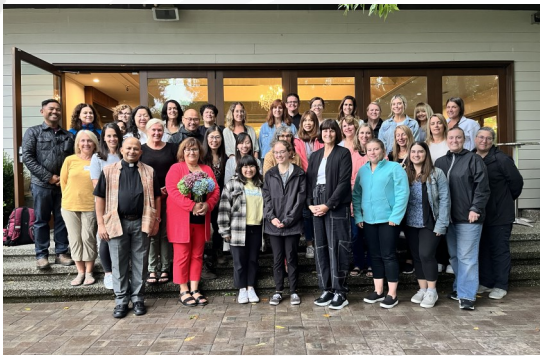
St. Mary's School Staff

The goal of Catholic Education is heaven, but knowledge alone will not get us there! "Virtues in Practice" will help our students to live out their faith in their everyday lives.