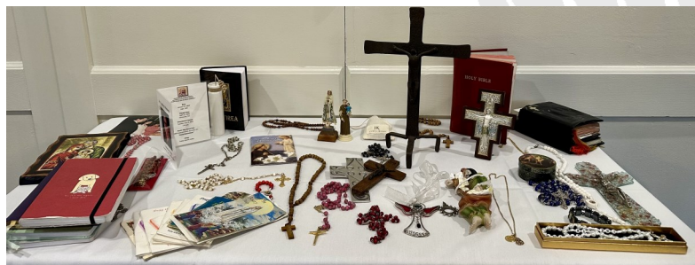
We each brought cherished spiritual relics and shared our deeply personal interpretations of our faith, drawing from the profound significance these relics hold for us.