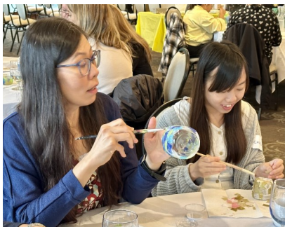
Creating an artifact for the prayer tables